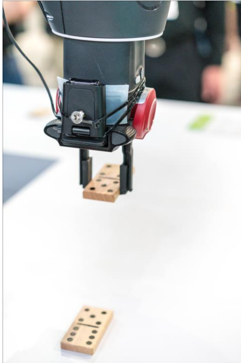
Figure 1-2. The dominoes-playing robot

The NVIDIA team used a graphics-rendering engine from its gaming platform to create images of dominoes in different positions, with different textures, and under different lighting conditions (see Figure 1-3 ). 11 No one actually manually set up dominoes and took pictures of them to train the model—the images that were created for training were simulated by the engine.